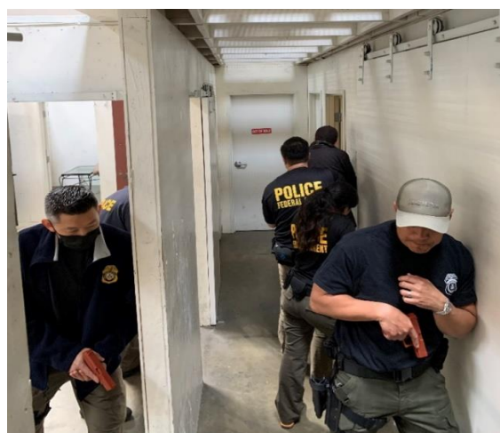
OEE Special Agents participating in a tactical training exercise

The Penalty: On June 17, 2021, USGoBuy, LLC agreed to pay a $20,000 civil penalty, $15,000 of which was suspended provided no violations occur during a three-year probationary period. In addition, a three-year denial of export privileges was imposed.