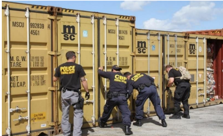
OEE Special Agents conducting an inspection

Fast-forward to the aftermath of September 11, 2001, and the focus of our country’s national security efforts pivoted to face a new and pressing threat of the terrorist attacks on our homeland by non-state actors like al-Qaeda. The changing nature of the threat meant OEE, in addition to investigating proliferation of WMD and destabilizing military activities, also worked more closely with the Department of Defense to prevent U.S. components from getting into the hands of terrorists for use in improvised explosive devices. In parallel, we expanded the use of our Entity List to allow for the designation of parties when supporting any activity contrary to U.S. national security or foreign policy interests.