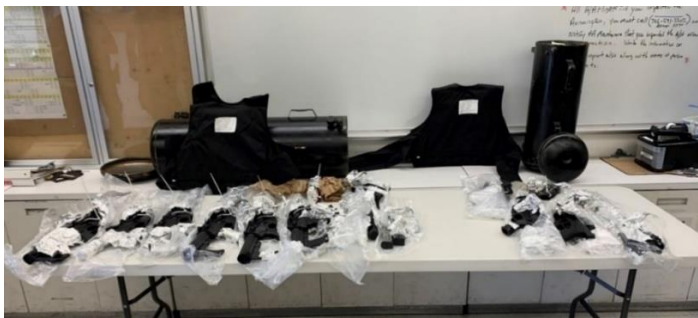
X-ray photo and photo of firearms concealed within air tanks, intercepted by Special Agents prior to their intended export