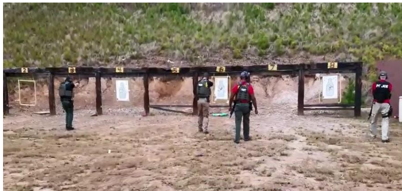
OEE Special Agents training at an outdoor firing range

The Penalty: In November 2018, Sheehan was sentenced to 24 months of probation, a $500 criminal fine, and a $200 special assessment. In September 2019, Mohamadi was sentenced to 24 months in prison, 24 months of supervised release, and a $200 special assessment. In October 2020, Shaneivar was sentenced to a $100,000 criminal fine and the forfeiture of three commercial properties appraised at over $2,000,000. IC Link was sentenced to a $200,000 criminal fine, and Alamdari was sentenced to a $5,000 criminal fine. On March 6, 2023, BIS issued Mohamadi and Shaneivar post-conviction denial orders for a period of 10 years.