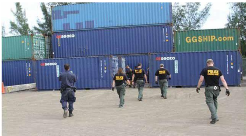
OEE Special Agents conducting inspections with U.S. Customs and Border Protection Officers

The Penalty: On June 9, 2021, Wu was sentenced to 52 months in prison (time served) and a $100 special assessment (suspended). In July 2022, Wu was deported from the United States. On December 1, 2022, BIS issued Wu a post-conviction denial order for a period of 10 years.