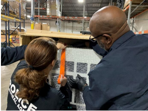
OEE Special Agents affecting a detention

The Penalty: On December 10, 2018, Yantai Jereh agreed to pay a $600,000 civil penalty. Additionally, a five-year denial of export privileges was imposed on Yantai Jereh, which was suspended provided that during the suspension period Yantai Jereh commits no future violations and pays the civil penalty, and eight additions were made to the BIS Entity List. A concurrent OFAC penalty in the amount of $2,774,972 was issued against Yantai Jereh and its affiliated companies and subsidiaries worldwide.